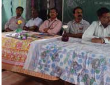
SDNV Vaishnava college - Chrompet