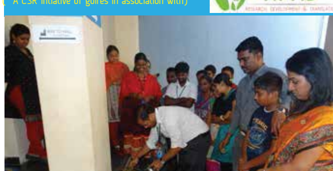
OUR INTEGRITY SOUNDS "SAVE TREES.